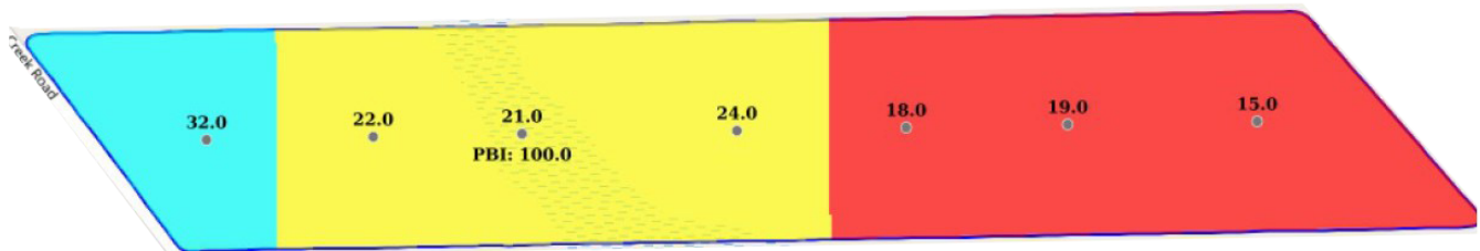
Map 1: Soil Phosphorus mg/kg

The project subsidised testing for a number of analytes across a number of paddocks. The paddocks tested were then paired, one paddock to have a VR application and the other the standard practice which was optional – to do nothing or to spread a standard blanket rate. In the case of the Beljon paddocks Jon and Belinda identified Phosphorus as being their most limiting nutrient across the paddocks selected for the project. As can be seen in Map 1, their overall Olsen P levels were not bad but there was variability.